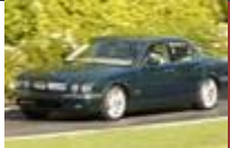
2005 Jaguar XJR

Check out the Reviews on ForbesAutos.com... for advice you can trust