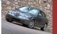
2006 Jaguar S-Type