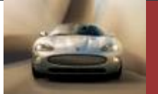
2006 Jaguar XKR